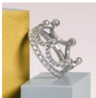
Queen's Court of Sales! $40,000 retail July 1, 2022— June 30, 2023