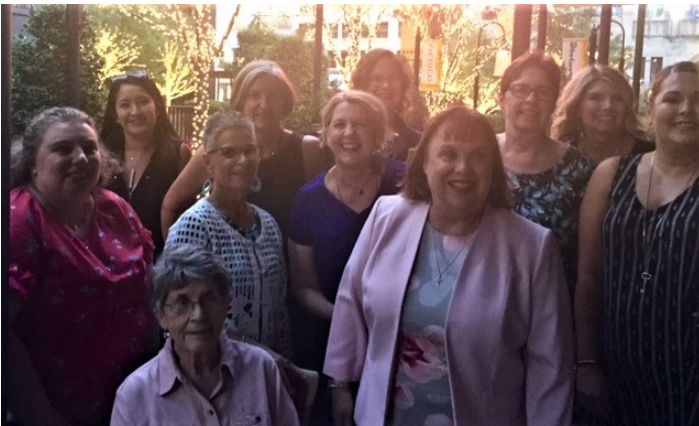
The Richardson Area sharing dinner, stories and awards!