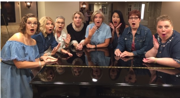
Don't miss Seminar next year! You'll never know what's going to happen next!