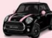
MINI® Hardtop 4-Door