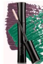
Limited-Edition Colored Lash Love Mascara