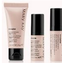
Gift with $40 Purchase