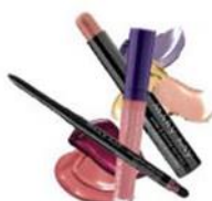
Limited-Edition Fairytales & Fantasy Collection