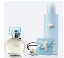
Special-Edition Thinking of You® Set

Visit www.MaryKayIntouch.com for more information.