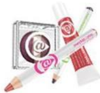
Mary Kay at Play™ Collection