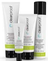
Clearproof™ Acne System

New products are available August 16th! (or August 10th if you enrolled in the Fall 2013 Preferred Customer Program)